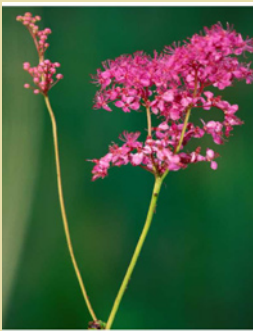
Queen-of-the-Prairie ( Filipendula rubra )