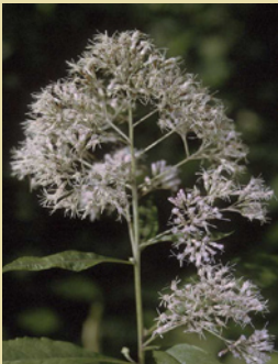
Sweet Joe-Pye-Weed ( Eupatorium purpureum )