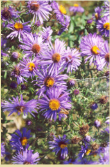
New England Aster ( Aster novae-angliae )