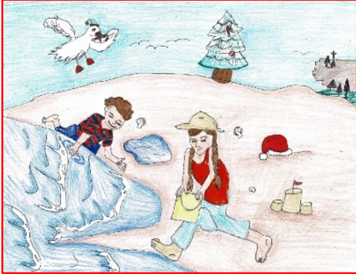
Isla Palumbo, Age 9 "Boy and Girl at Surfer's End"